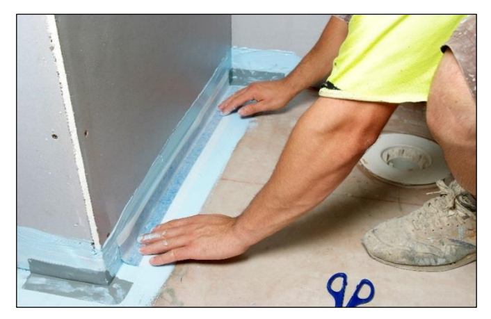
Installing Elastoproof B50 Bond Breaker Joint Band

For floor pipes protruding floors, Elastoproof Collars are to be fitted over the neck of the pipe, embedding fabric edges into wet bed of Gripset P-39 membrane. For sealing penetrations where Elastoproof product cannot be used, seal around base of penetration at abutment to substrate using Gripset SB sealant followed by cut strips of RF Fabric embedded into P39 membrane.