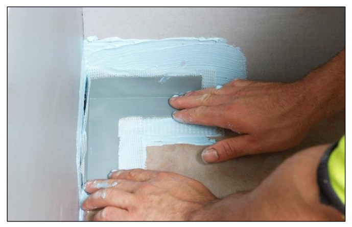
Installing Elastoproof Prefabricated Corners

Measure and cut Elastoproof Joint Band for all wall/floor junction areas. Apply first coat of Gripset P39 membrane to extending 150mm up walls and on to floors, and embed Elastoproof Joint Band into wet bed of liquid membrane, ensuring fabric edges are fully wet out and no air bubbles exist behind the fabric. Rear rubber section of Elastoproof Joint Band is not bonded to substrates. At sections where Joint Band is to be joined, a minimum 50mm overlap is required. Elastoproof Prefabricated Corners are available for both internal (90°) and external (270°) junctions, enabling Joint Band to overlap and avoid joint at critical areas. If Prefab corners are not used, Elastoproof Joint Band is to have bottom leg cut and folded; ensuring fabric is completely bonded with Gripset P39 membrane.